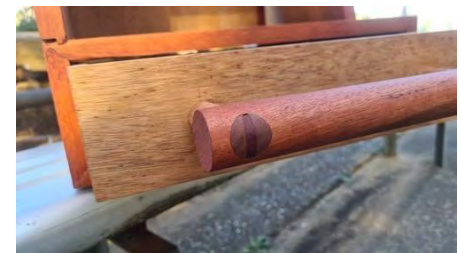
Chas Taylor-Colless - Bedside Table.