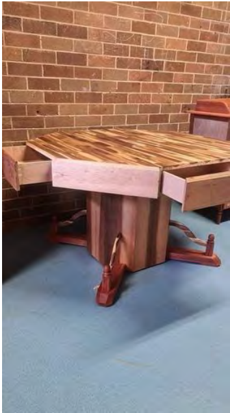
Jasper Tobin - Gaming Table