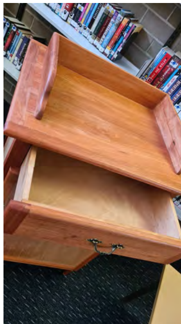
Tia Marmion - Birdcage stand