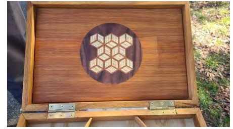
Reilley Hunt- Card Storage Box