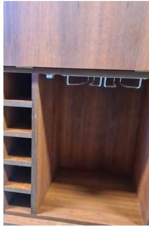
Will Lanyon- Liquor Cabinet