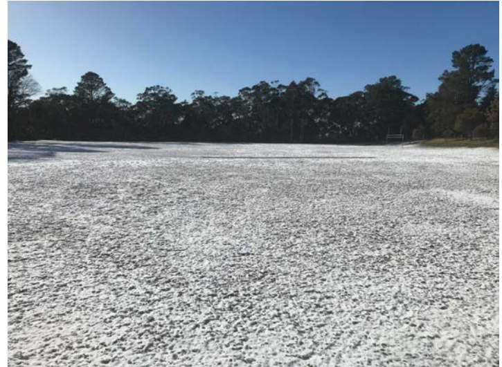
Photo of school oval

While we missed spending the day together on Wednesday, it was wonderful to see our school and home town sprinkled in winter magic!