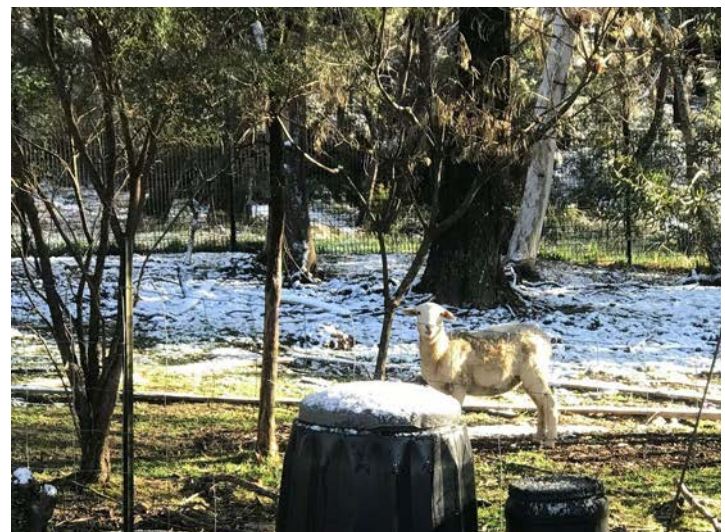
Photos of our resident sheep and school grounds